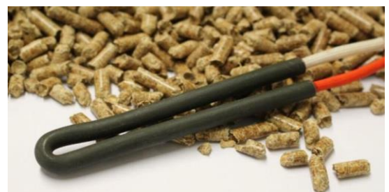
U shape metal igniter available